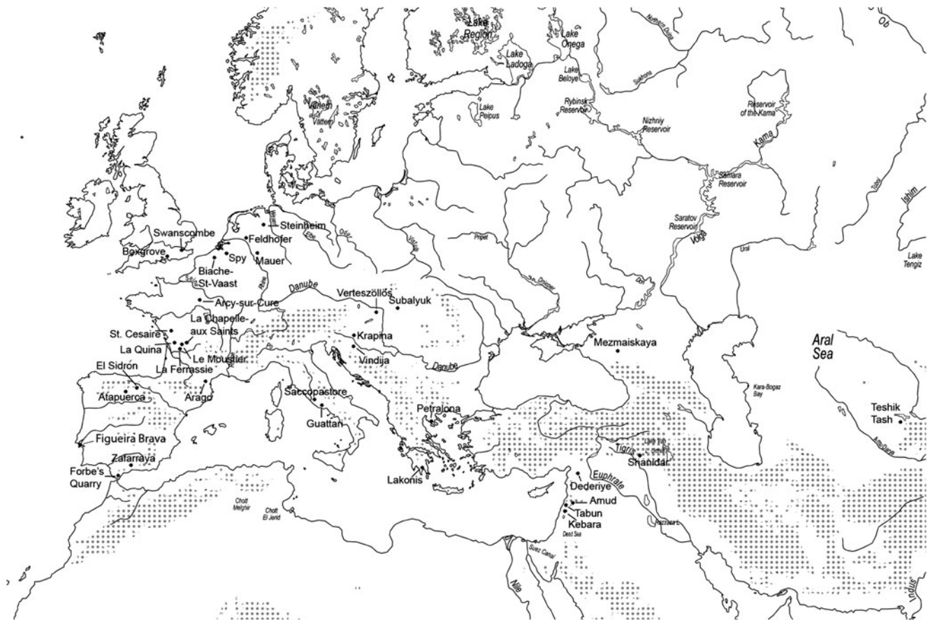
Fig. 1 Map of the geographic distribution of Neanderthals, showing important Neanderthal and pre-Neanderthal sites. Adapted from Harvati 2007

chance-driven processes (genetic drift; e.g., Hublin 1998; Weaver et al. 2007).